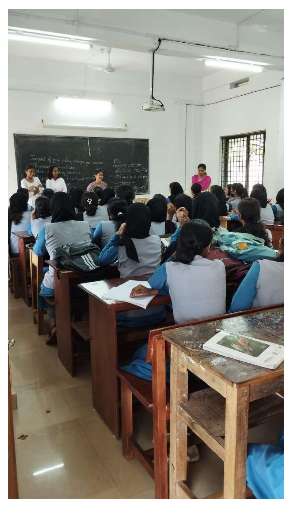
MADAYI GIRLS HIGHER SECONDARY SCHOOL