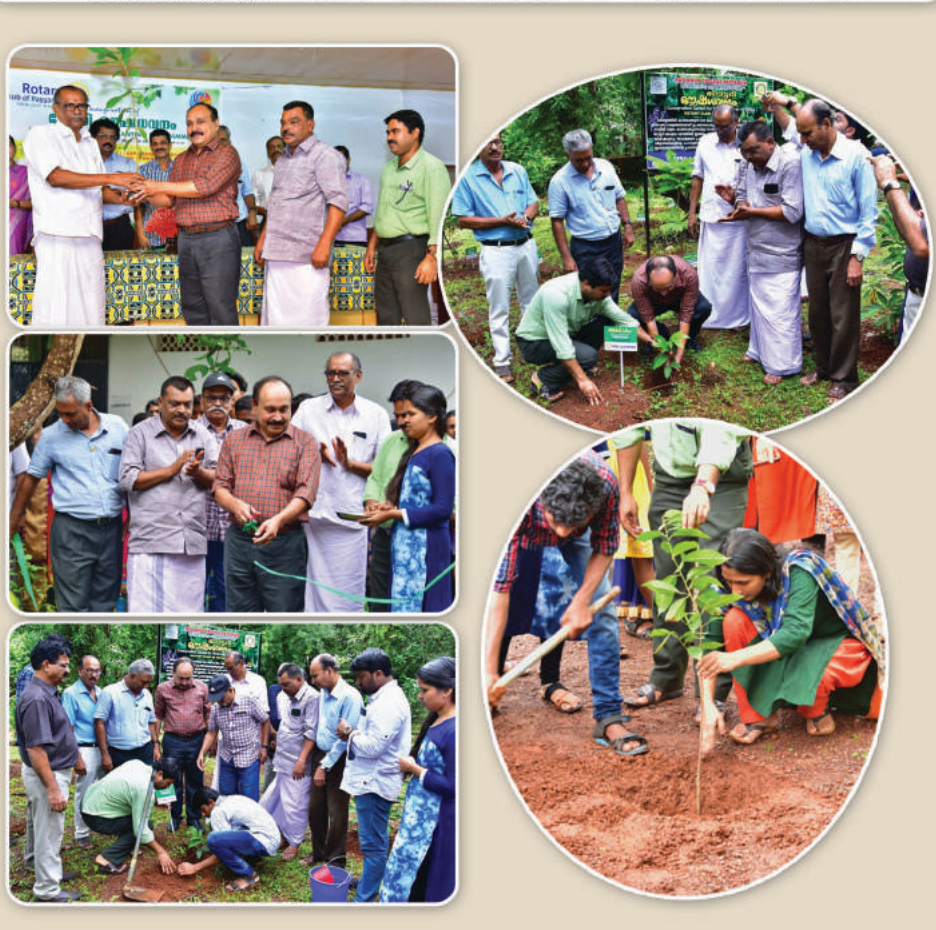
Giving Breath to Dying Wealth