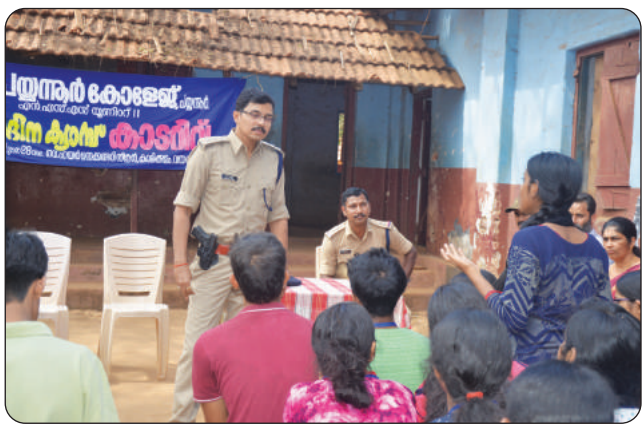
Interaction with Superintendent of Police, Wayanad