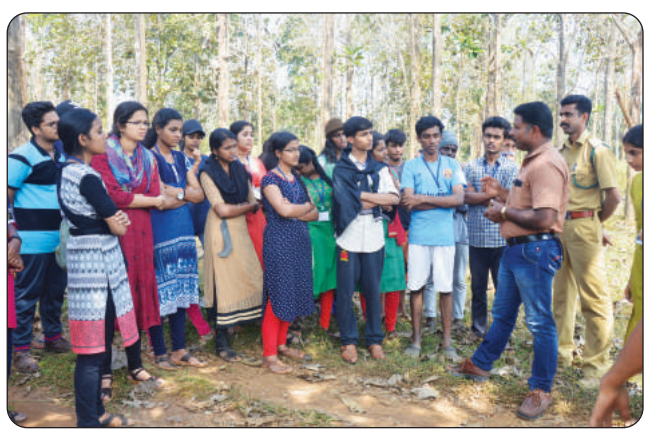
Interaction with Forest Officials inside Wayanad Wildlife Sanctuary