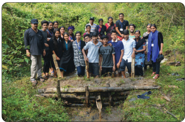
Construction of Check Dams inside Wayanad Wildlife Sanctuary