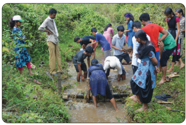
Construction of Check Dams inside Wayanad Wildlife Sanctuary